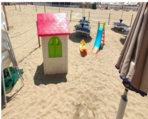
Playground on sandy bottom